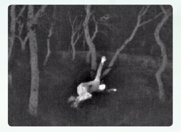
Lifeguarding & Rescue

Equip law enforcement officers and guards with nighttime and bad-weather daytime vision to improve their safety by identifying potential threats.