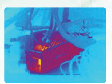
Electricity Certification & Maintenance

Locate construction defects and humidity, map water pipes, track insulation flow to decrease energy consumption and reduce expenditure.