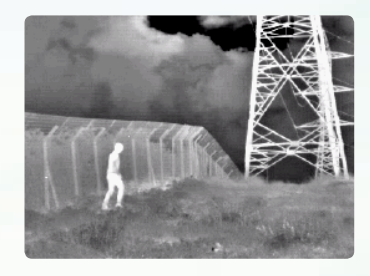
Security and Safety

Equip law enforcement officers and guards with nighttime and bad-weather daytime vision to improve their safety by identifying potential threats.